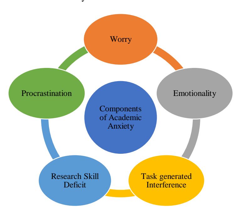
Figure 1. Components of Academic Anxiety

Academic anxiety has four components, worry, emotionality, taskgenerated interference, and research skills deficits, (Cornell, 2015). The components of academic anxiety are as follows: